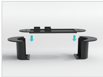
1. Splice the brackets together and install them