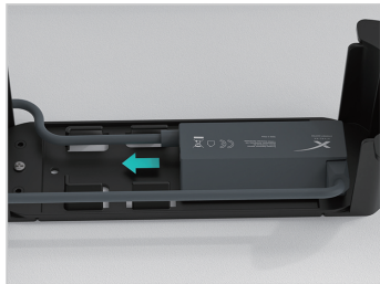
3. Mount the Ethernet Adapter on the bracket