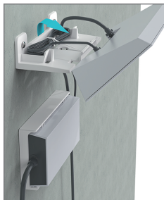
3. Plug the power cord and network cable into the router