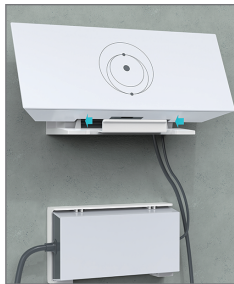
4. Tilt the router to align with the bracket slot