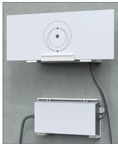
6. Installation completed