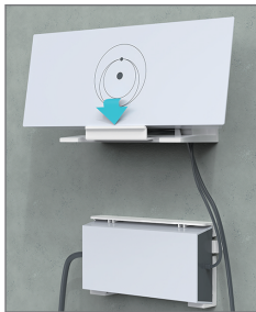
5. The router pushes down on the carabiner to fasten automatically.